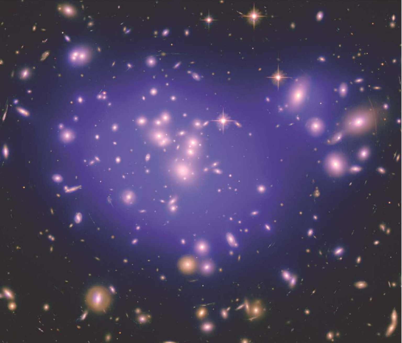
Galaxy cluster Abell 1689 seems to be held together by swaths of unseen dark matter; blue shows its theoretically inferred location. But could dark matter be an illusion?

with the dimensions of space. In Barbour's universe, on the other hand, time is emergent: It is a measure of how space changes but not a fundamental component of it.