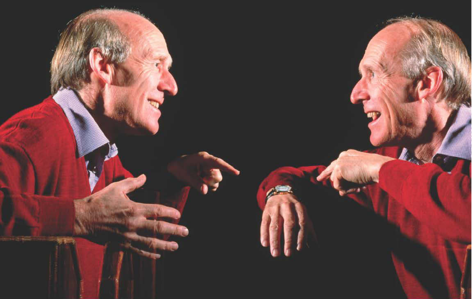
Julian Barbour has spent his life arguing against Einstein's view of gravity, space, and time.