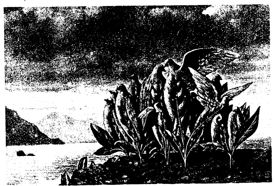
Future plants: Will they obtain beauty from genes that are now found only in birds? 14 OMNI ,

Last summer Shepard grew 2,300 potato clones on farmland stretching across North Dakota and Colorado. Some CONTINUED ON PAGE 128